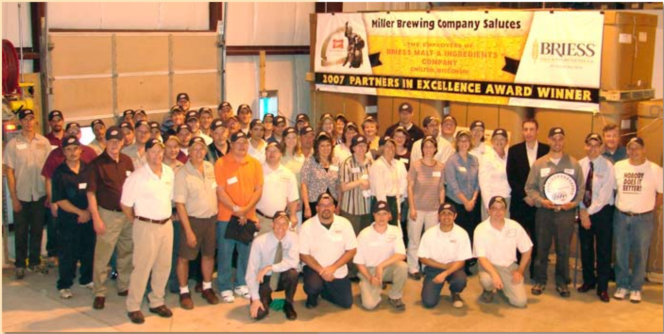
THE BRIESS TEAM —Employees from all Briess plants and facilities gathered for this rare group photo taken at the Miller Brewing Company presentation of its “Partner in Excellence” award. Not pictured are shift workers and employees who kept makin’ malt and answering phones.