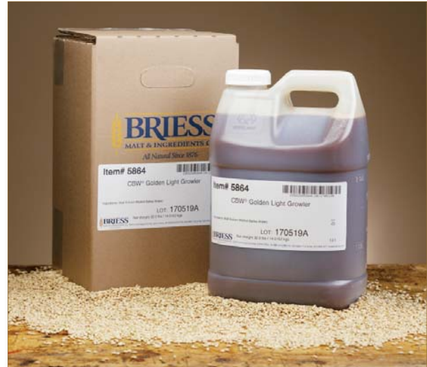
32-pound growlers are individually boxed for easy stacking and storage.